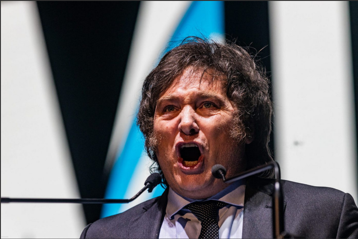
Pictured: Javier Milei

It has been some time now since self-described 'anarcho-capitalist' Javier Milei assumed the Presidency of Argentina, after defeating centre-left rival Sergio Massa by three million votes in November's election. But what is this Mick Jagger-impersonating, chainsaw-wielding, socialism-loathing, Al Capone-adoring enigma of an individual planning?