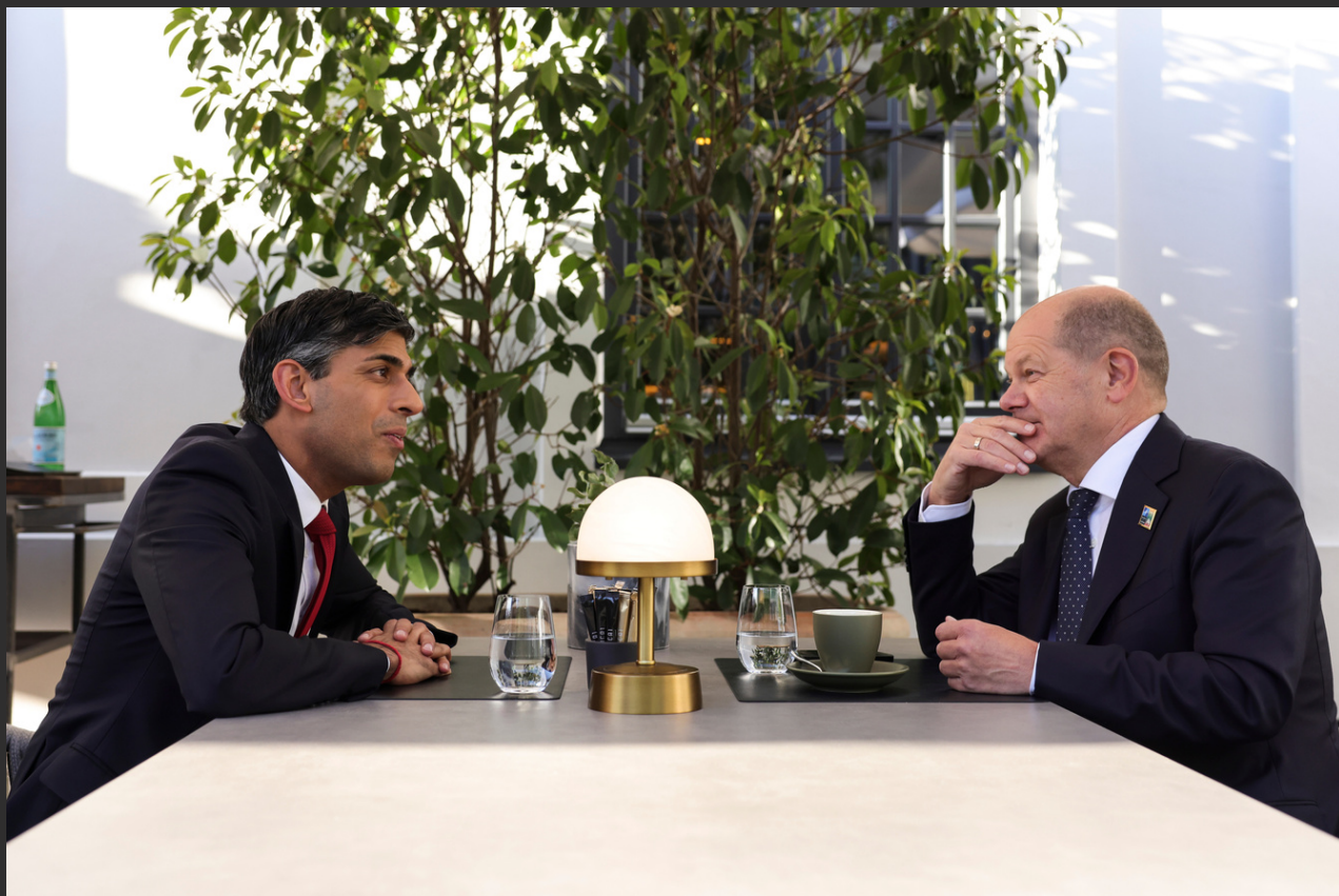
Pictured: Rishi Sunak and Olaf Scholz

Rishi Sunak's tenure has represented a profound stalemate within the Conservative Party, where the regicidal instincts of a disillusioned party have to be suppressed just enough to make it to the next election without cameras turning to Graham Brady again. Upon entering Parliament in 2015, Sunak would have found himself on the right of the party as a leave supporter opposing remainers and soft Brexiters in his party. He now finds himself as a 'moderate' within the Tory party without having moved a muscle. The membership is to the right of the Parliamentary party, and Sunak has never won them over and is currently one of the most unpopular cabinet members amongst party members. Having been defeated by Liz Truss 57% to 43% in the 2022 leadership election, Sunak was able to walk into 10 Downing Street uncontested, after the crash and burn of Truss and Kwarteng's neo-Thatcherite agenda, and ostensibly be the face of stability.